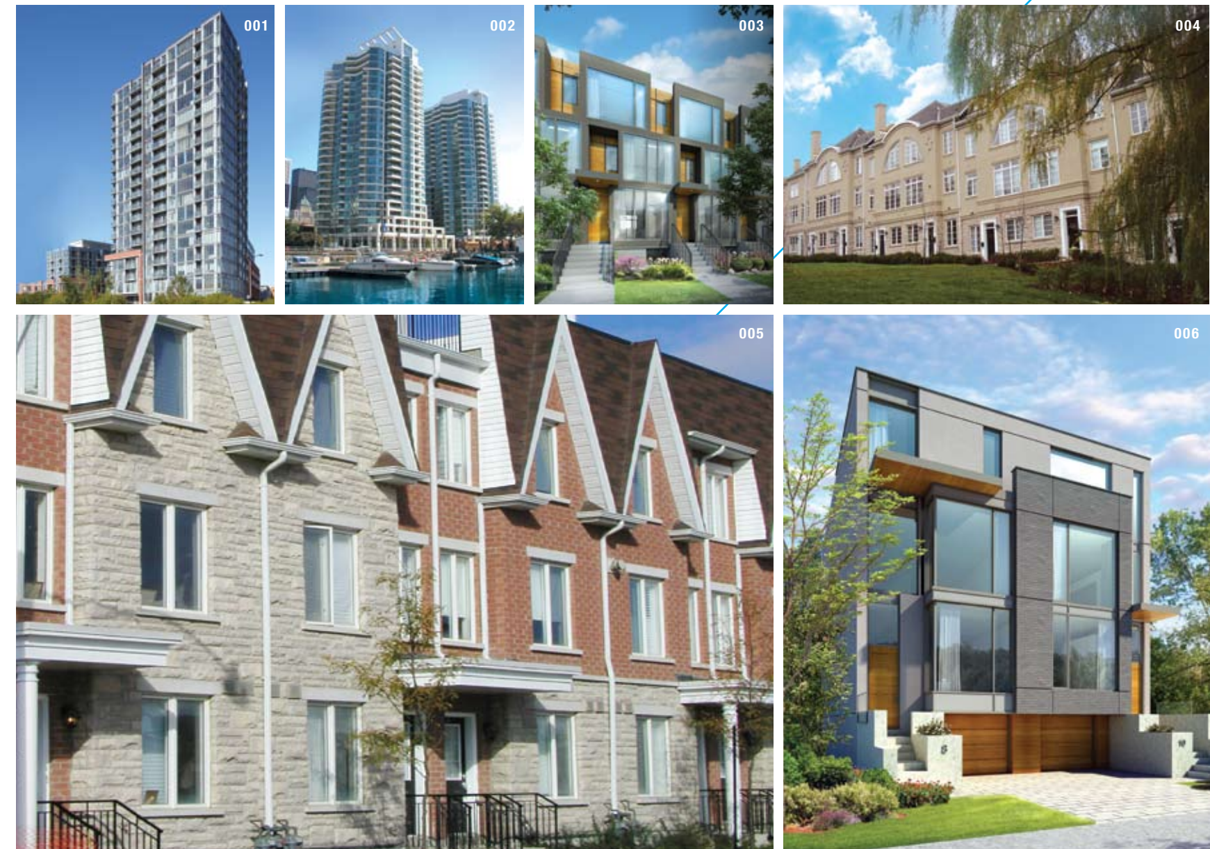
001 WESTSIDE LOFTS /// 002 RIVIERA /// 003 NEIGHBOURHOODS OF DOWNSVIEW PARK /// 004 HOGG'S HOLLOW 005 KING WEST VILLAGE /// 006 NEIGHBOURHOODS OF QUEEN STREET EAST

Terra Firma Capital Corporation (TSX: TFI) is a boutique real estate finance company that provides customized debt and equity solutions to the real estate industry. The company focuses on providing financing and investing in quality commercial residential developments and income producing properties throughout Canada and the US. Since 2011 TFCC has provided financing and participated in the development of over 2,000 residential units in a variety of high rise and low rise projects.