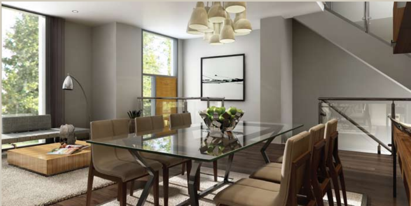
BIRCH LIVING ROOM ARTIST'S IMPRESSION