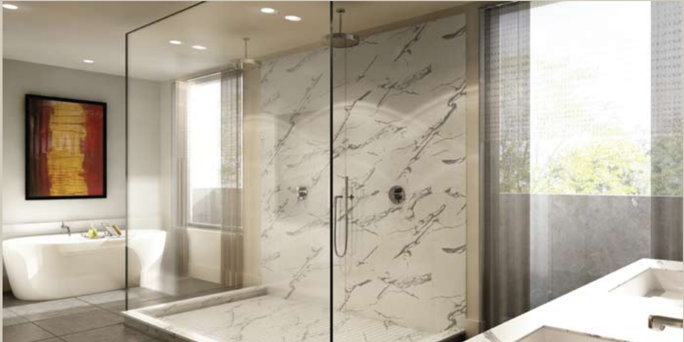
BIRCH MASTER ENSUITE ARTIST'S IMPRESSION