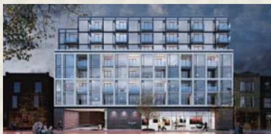
WEST QUEEN WEST