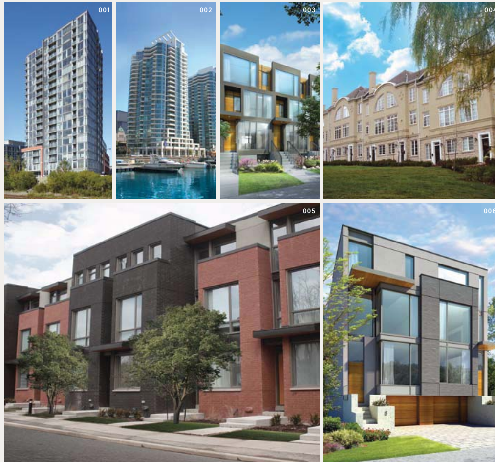
001 WESTSIDE LOFTS /// 002 RIVIERA /// 003 NEIGHBOURHOODS OF DOWNSVIEW PARK /// 004 HOGG'S HOLLOW 005 RIVERDALE /// 006 NEIGHBOURHOODS OF QUEEN STREET EAST